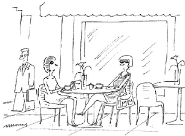
"It didn't work out. I'm a Macintosh Classic and he's an IBM clone."